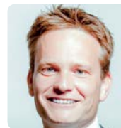
Coert van Zijll Langhout Dredging Today / Navigo