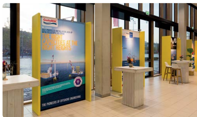
Above is an impression of the display's design which will be customised for the event.